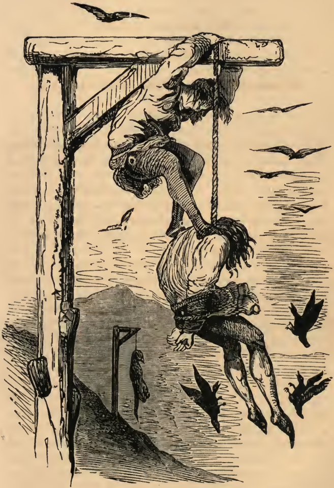
He was delicately strangled between the head and shoulders so that he expired.